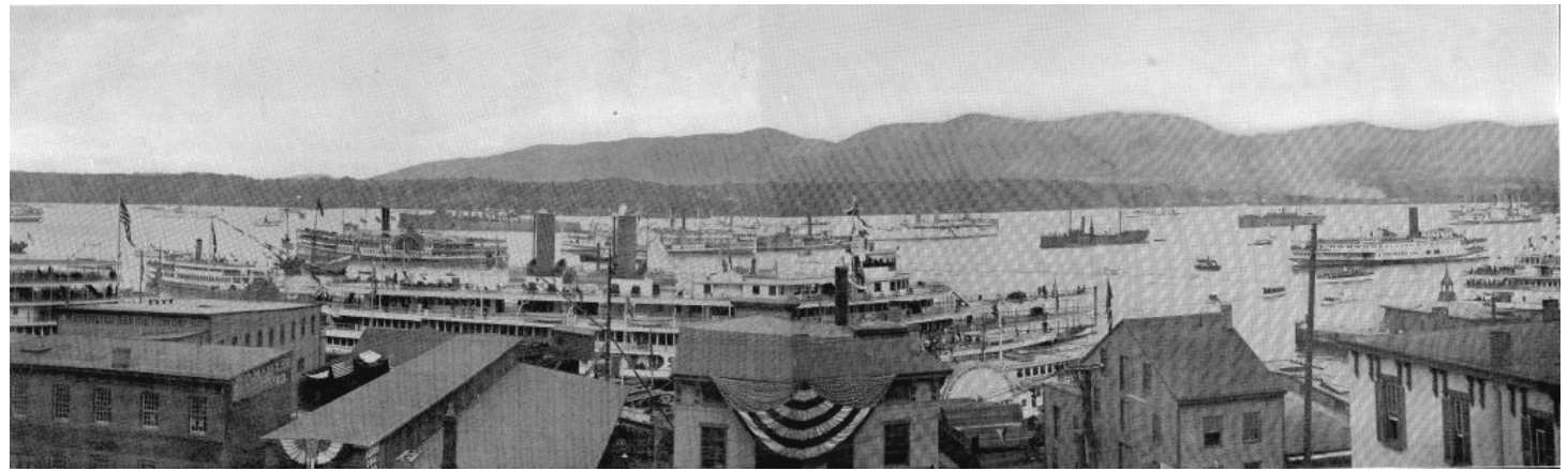
The Naval Parade arriving at Newburgh, October 1, 1909